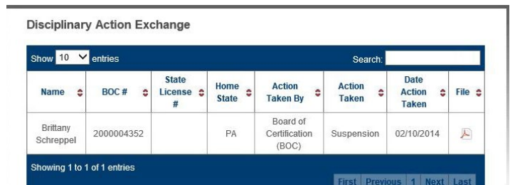
Preview of Disciplinary Action Exchange